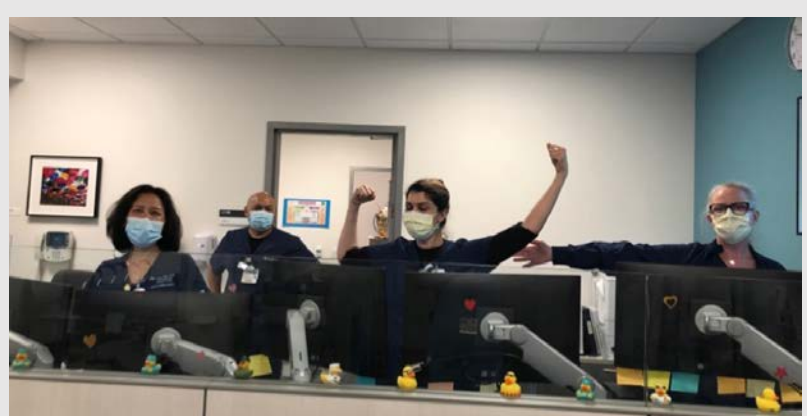
PCMB Radiation Oncology Nurses trying to stay apart while still sticking together!